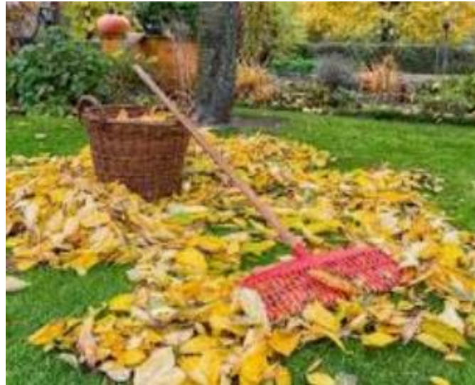
Rake and Bag Your Leaves

Please also remember that metal roofs are not permitted—not even on sheds or patio covers. All roofing must be shingled and weathered wood in color.