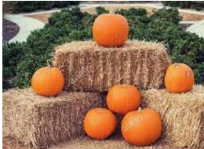
Be Sure to Rid Your Beds of Weeds and Dead Plant Material and Spread Fresh Mulch or Pine Straw.